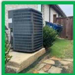
Protected From Wind