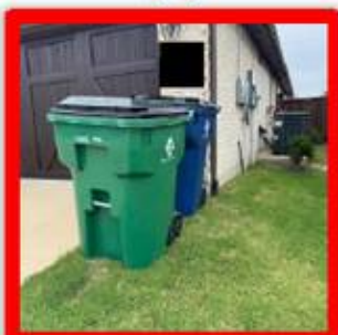
Past Corner Edge On Lawn