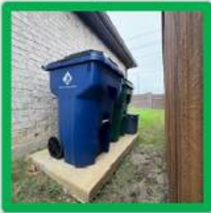
Approved Concrete Pad