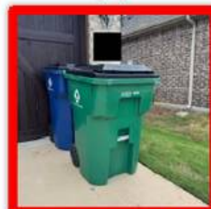
Bin Not Under Eave